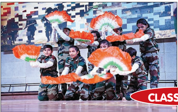
CLASS 6 'U'