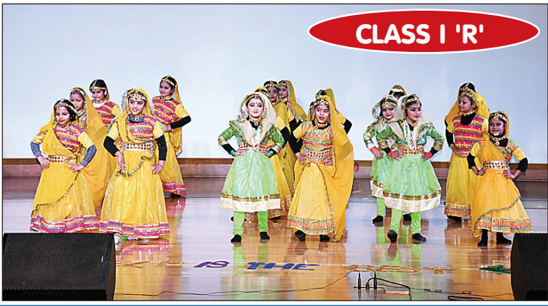
CLASS 1 'R'