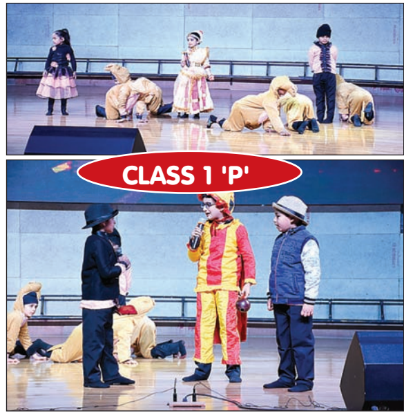
CLASS 1 'P'