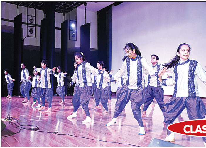
CLASS 6 'W'